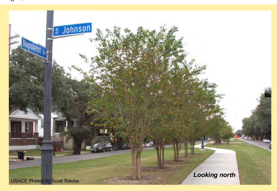
Napoleon Avenue, SELA Phase I, construction and landscaping complete