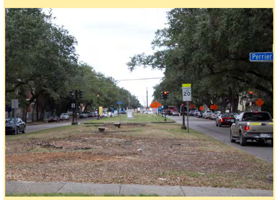
This recent photo of Napoleon Avenue at Perrier Street shows shrub clearing work is underway as part of SELA Phase III.