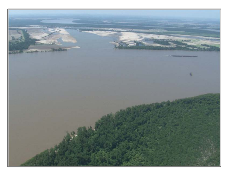
Island 13 overbank crevasse post 2011 flood.