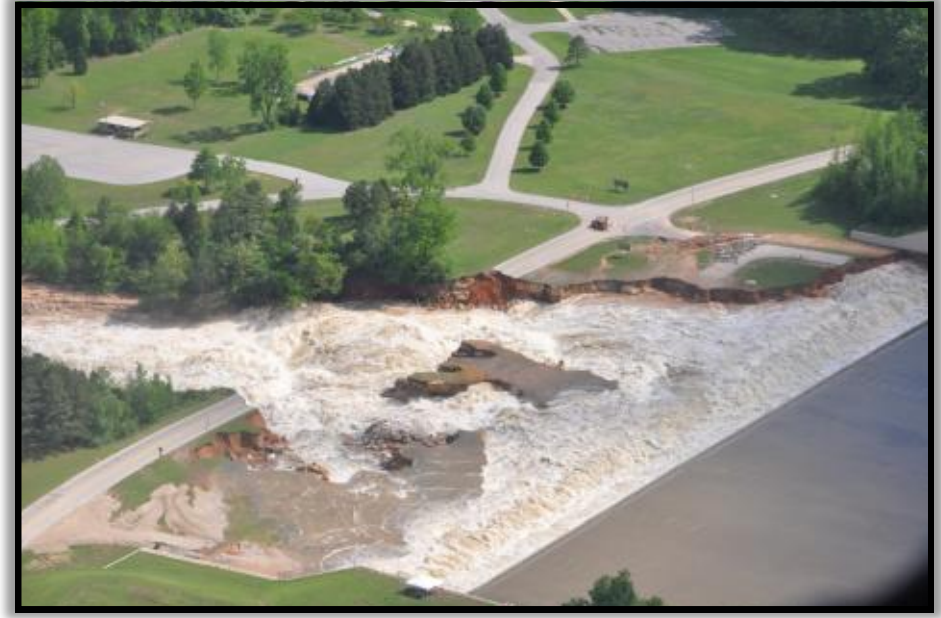
2011 flood - ?????

to provide a wider floodplain; executing a cutoff at Bessie Bend to increase the slope and lower flood stages upstream of the bend throughout the floodway reach; and a plan of natural overtopping of the frontline levee. The study concluded that several of the alternatives were feasible from an engineering viewpoint, but were not justified economically. The study further concluded that the plan of natural overtopping of the frontline levee without artificial crevasses would serve as an alternative to the 1986 plan of operation and would provide a higher level of protection for the lands within the floodway. This alternative would require raising the upper fuseplug section to