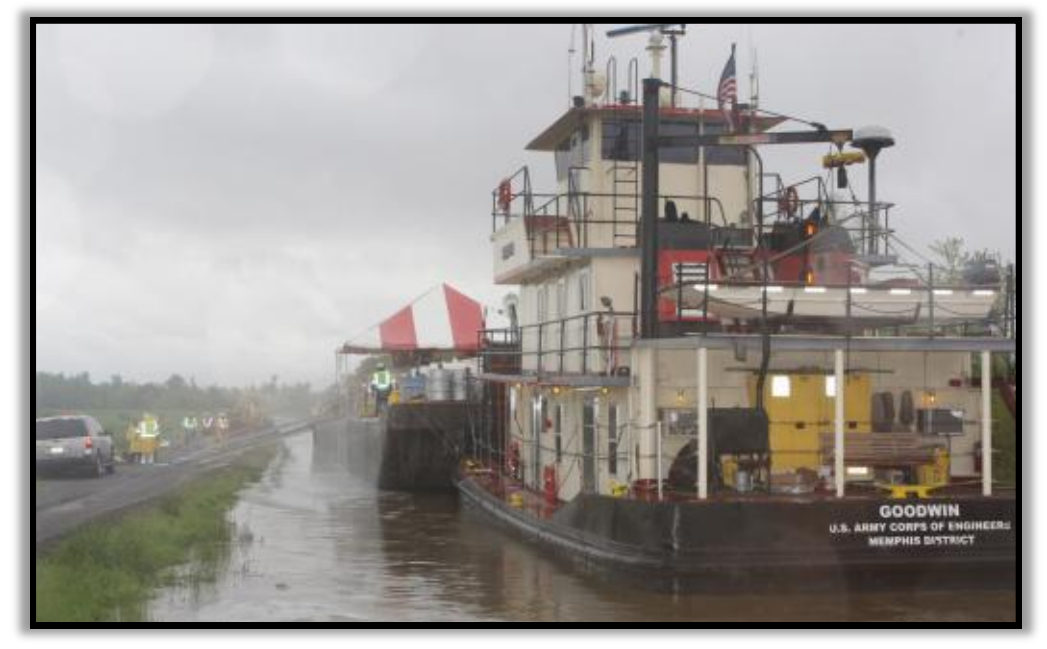
2011 flood - loading levee pipes with liquid blasting agent.

In the spring of 2011, the lower Mississippi River experienced record-setting flood stages that ultimately prompted the second ever activation of the Birds Point -New Madrid floodway. On April 25, the stage at Cairo reached 55 feet with a forecasted crest stage of 60