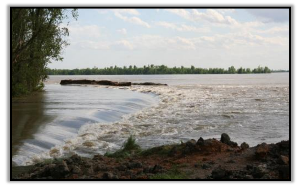
2011 flood - upper levee crevasse.

As pumping operations commenced, the floodway preparation task force experienced several problems, including a bad mixing unit on one the two barges and a spur levee that denied the barges access to a portion of the upper inflow crevasse site. Facing time constraints and a rising river, the task force, at the request of Maj. Gen. Walsh, developed and implemented an accelerated operations plan that called for preparing only 9,000 feet of the