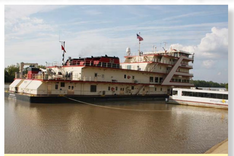
Pictured is the Motor Vessel MISSISSIPPI.

• August 14 - 9:00 a.m., Cape Girardeau, Mo. (City Front)