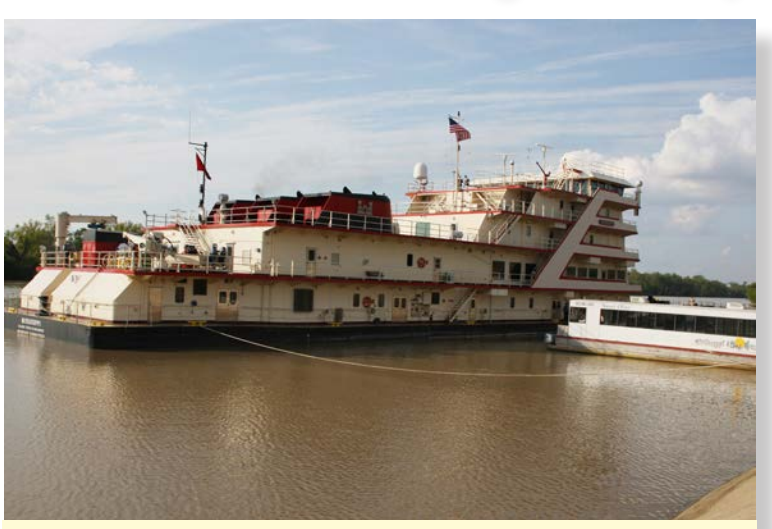
Pictured is the Motor Vessel MISSISSIPPI on the Mississippi River in Vicksburg, Miss., during a high-water inspection trip.

1. Summary report by president of the commission on national and regional issues affecting the U.S. Army Corps of Engineers and commission programs and projects on the Mississippi River and its tributaries.