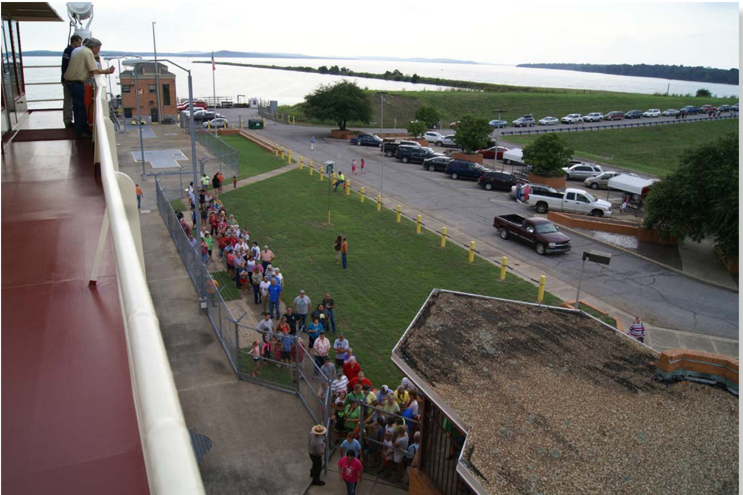
Several hundred visitors line up at the dock to board the motor vessel MISSISSIPPI for an open house at the R.S. Kerr L&D in Sallisaw, Okla., Aug. 8, 2014, during the MRC's low-water inspection trip.