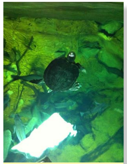
A 1550-gallon aquarium is being prepared for pets in the LMR Museum and Riverfront Interpretive Center.

Displays and exhibits inside the Motor Vessel MISSISSIPPI are scheduled to be completed approximately mid-July 2012. The Engineer