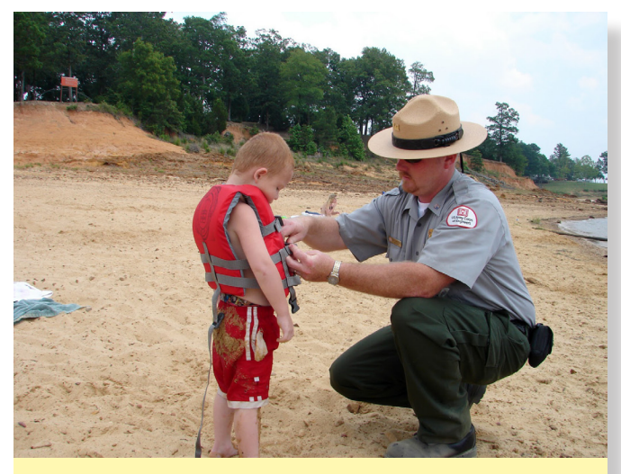
Pictured above—A Corps Ranger assists a young swimmer with his PFD (personal flotation device) at a beach on Enid Lake.

The following life jacket wear requirements will remain in effect